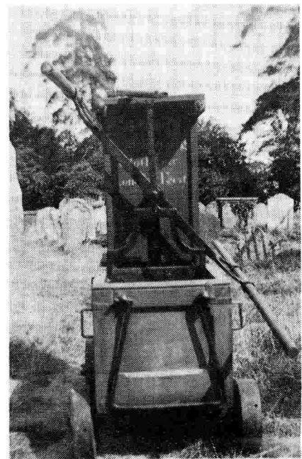
Worlingworth Fire Engine